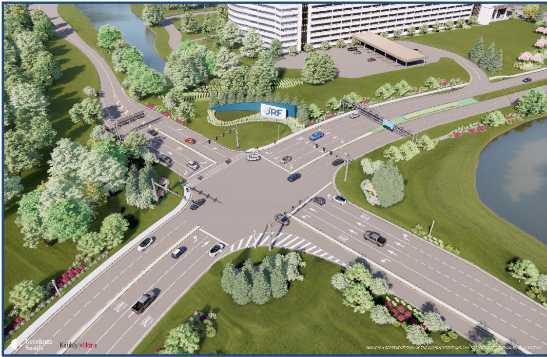
Rendering of ORF's upcoming four-way intersection, courtesy of Gresham Smith and Kimley Horn.